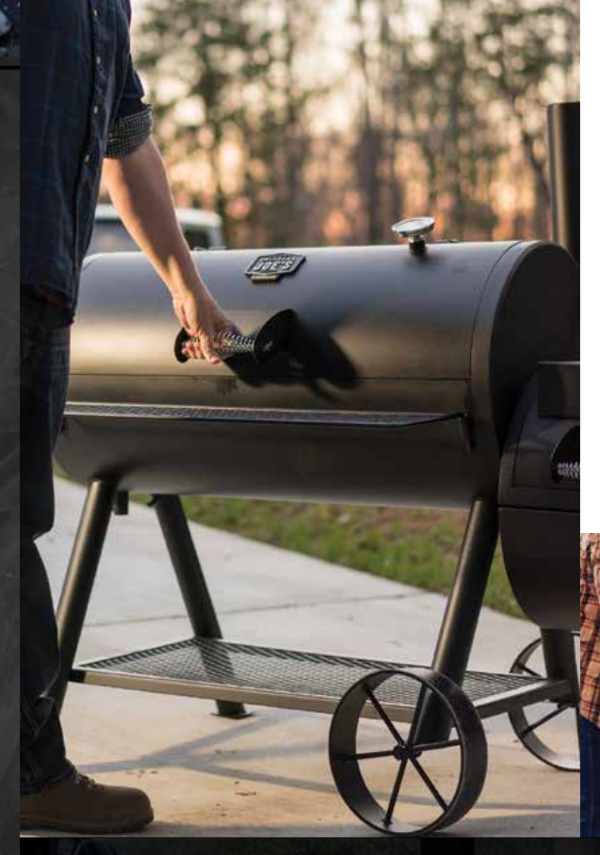
19" x 13.6" (48 x 34.5cm)