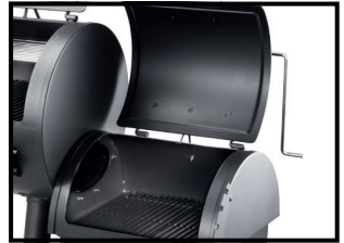
Firebox cooking grates for extra grilling capacity