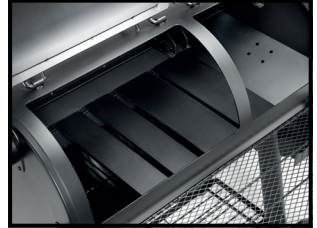
Adjustable baffles for even heat distribution