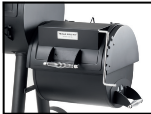
Flat firebox lid for warming marinades and sauces