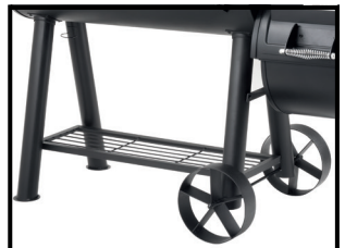
Wood storage shelf, heavy duty tube legs and steel wheels