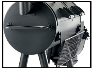
Collapsible food preparation shelf and side handle to hang utensils