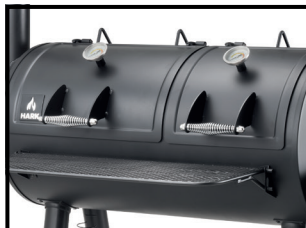
Chrome plated steel handles and two temperature gauges