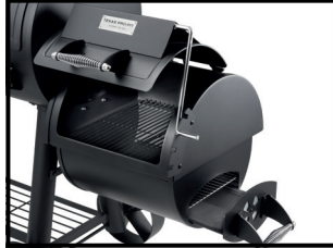
Adjustable lid and damper for effective heat regulation