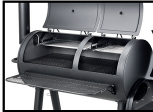
Large cooking grates and warming shelves