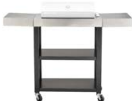
Trolley Only TCE-TROLLEY - Add workspace with trolley, with stainless steel foldable side shelves.