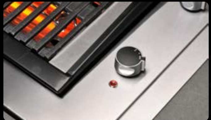
LED indicator with 120 Min timer and 300°C safety cut-off