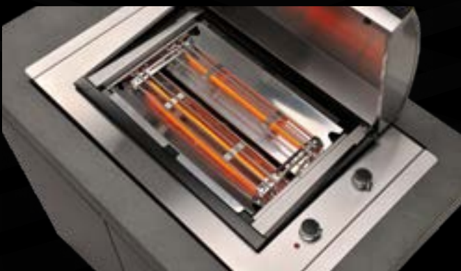
Flush mounted High output BBQ with carbon infra-red electric elements