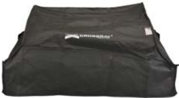
Electric BBQ Cover TCE-COVER - Outdoor rated cover, suitable for all three BBQ versions.