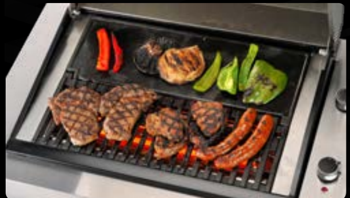
Dual Zone cooking (High/Low, Front/Back) with grill & hotplate as standard