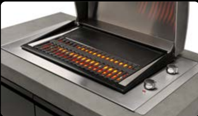
Substantial 60mm composite benchtop