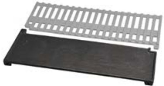
Replacement Half Hotplate TCE-HOTPLATE - As a replacement or to make a full hotplate.