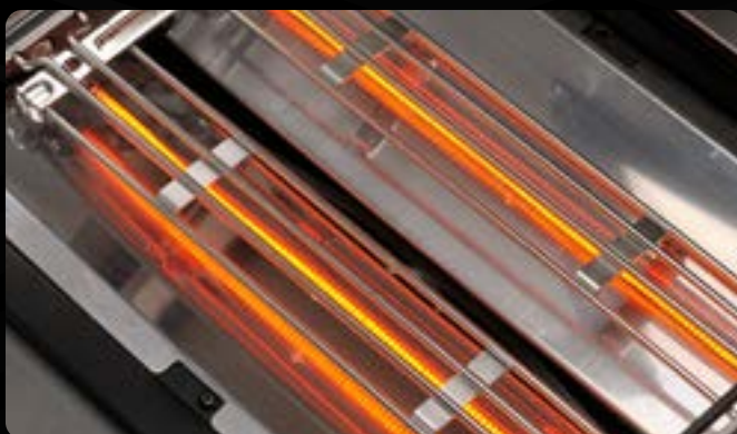
High output BBQ with carbon infra-red electric elements