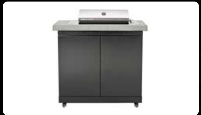
Powder coated black cabinet with double-skin doors and shelves