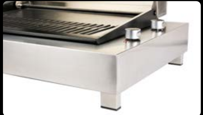
Feet Set TCEAC-001 - For table-top use, finish off your BBQ with this set of stainless steel feet.