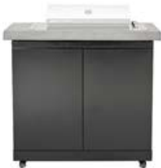
Cabinet & Benchtop Assy TCE-CABINET - Allows the BBQ to be flush mounted into a composite benchtop.