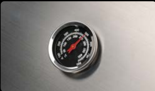
Stainless steel construction with double skin hood