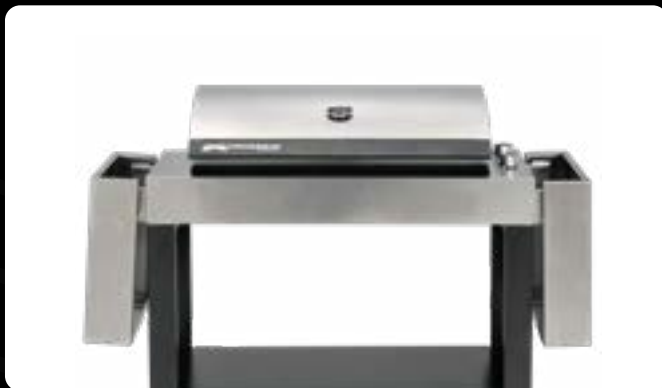
Trolley with foldable stainless steel side shelves