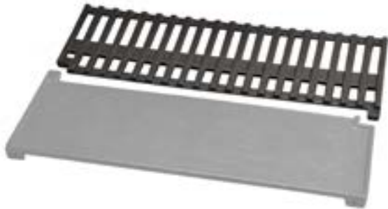
Replacement Half Grill Plate TCE-GRILL - As a replacement or to make a full grill plate.