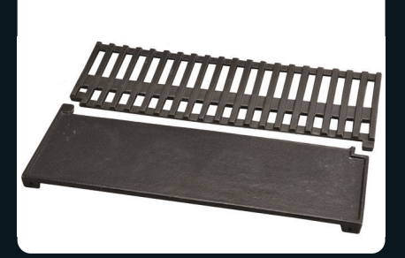
Grill & Hotplate TCE-GRILL & TCE-HOTPLATE