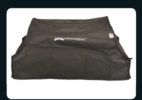
BBQ Cover TCE-COVER