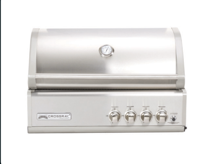
4 burner in-built BBQ Model TCS4FL