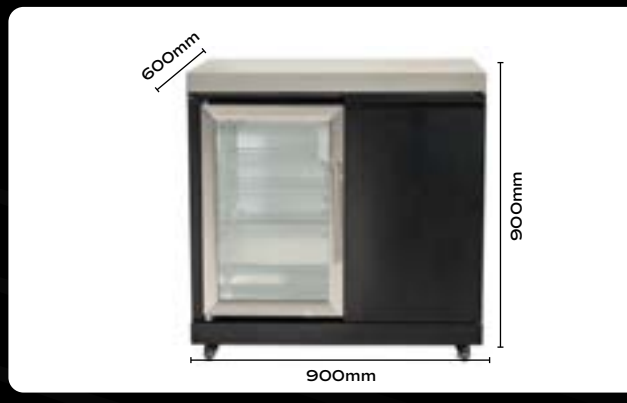
Fridge Cabinet TCK-FRIDGEASSY - Includes a double side cabinet, 63L fridge, single door and flat benchtop.