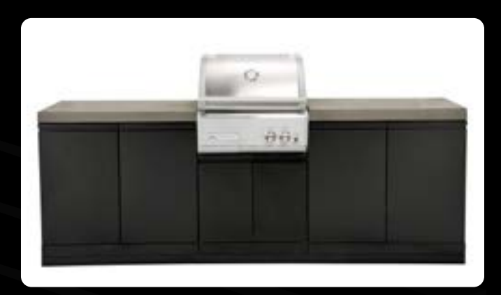
TC2K-01 - Double side cabinets with flat benchtops