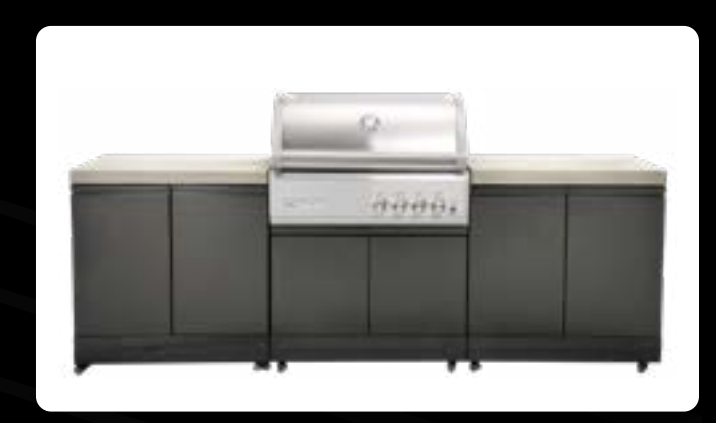
TC4K-01 - Double side cabinets with flat benchtops