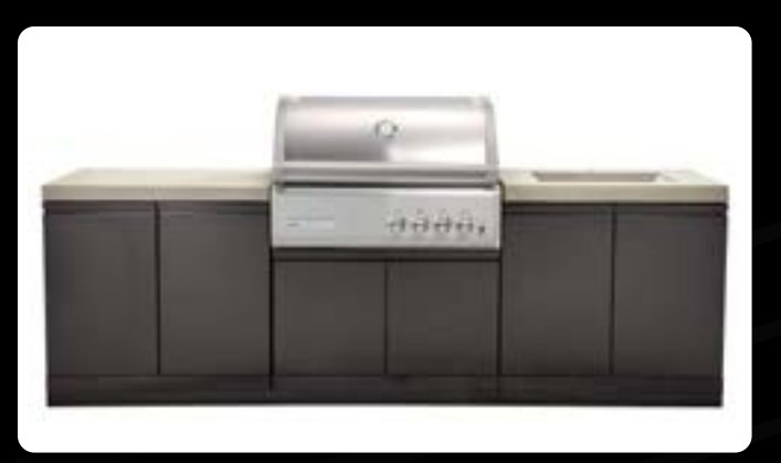
TC4K-02 - Double side cabinets with 1 x flat benchtop (L), 1 x sink (R)