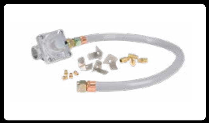
NG Conversion Kit TCS4AC-003 - Natural gas conversion kit - brass jets, Alloy NG regulator.