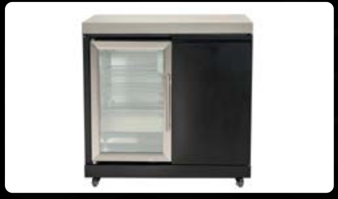
Multiple options available, including flat benchtops, moulded sink and single fridge