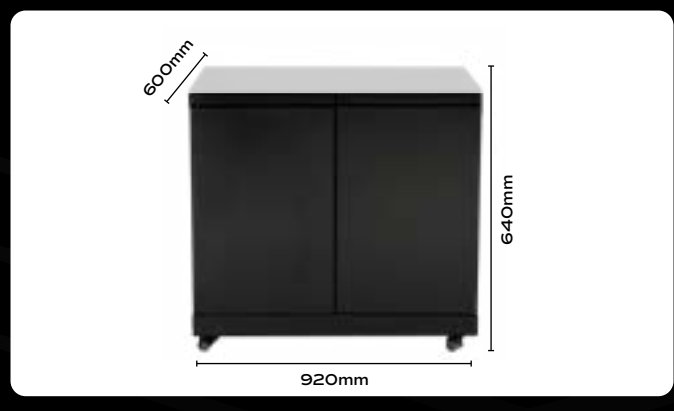
Side Cabinet TCK-SIDECAB - Double skin doors and middle shelf provide plenty of storage space.