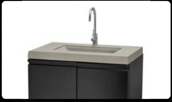
Multiple options available, including flat benchtops, moulded sink and single fridge