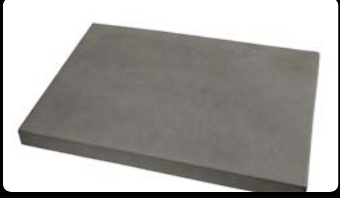
Flat benchtop TCK-FLATTOP - A 60mm flat composite benchtop. For use with TCK-SIDECAB.