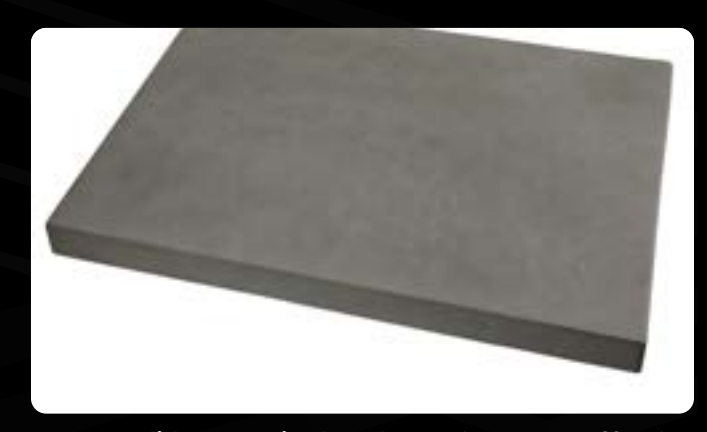
60mm solid composite benchtops (concrete effect)