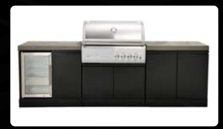
TC4K-03 - Double side cabinets with flat benchtops and single fridge (L)