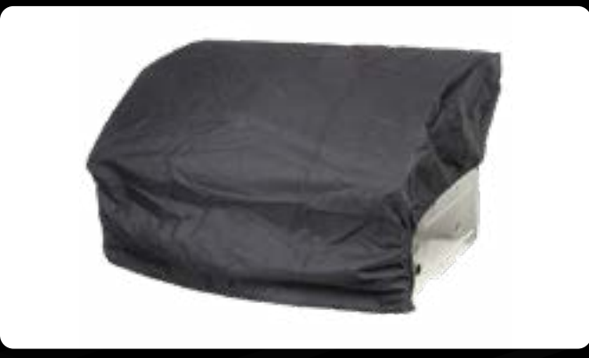
BBQ Cover TCS4AC-004 - Cover for 4 Burner BBQ Woven polyester.