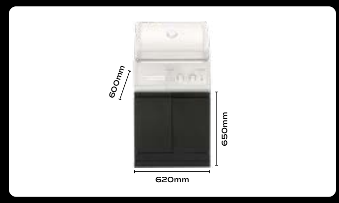
2 Burner Kitchen Cabinet TC2K-BBQCAB - Supports your 2B Series BBQ, with easy access double doors.