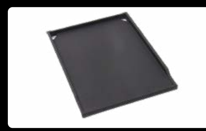
Hotplate TCS4AC-001 - Hotplate (for CROSSRAY Gas BBQ) made from Ceramic coated cast iron.