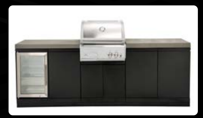
\ensuremath{\text{TC2K-03}} - Double side cabinets with flat benchtops and single fridge (L)