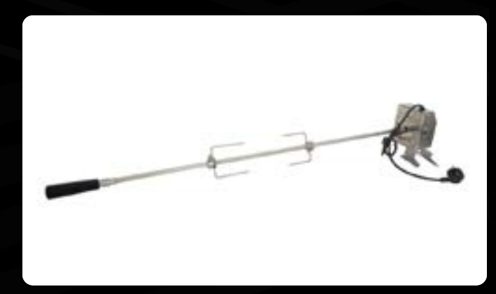
Rotisserie Kit TCS2AC-007 - Rotisserie kit for 2 Burner BBQ - S/S shaft & prongs IPX4 motor.