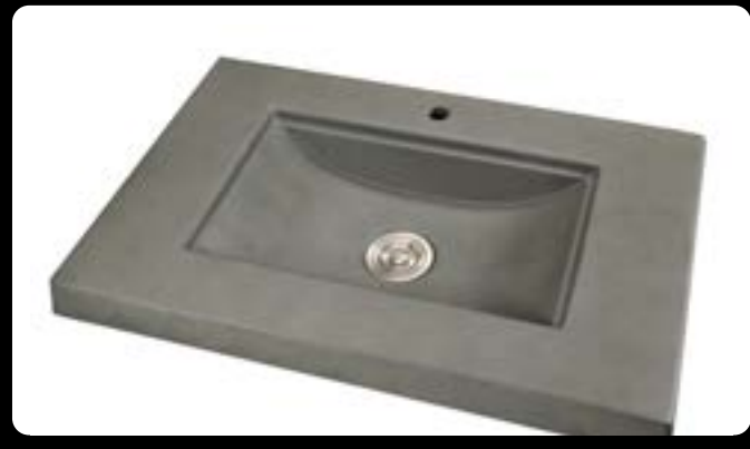
Sink Unit TCK-SINKTOP - 60mm composite benchtop with moulded sink, SS cover and pre-drilled tap hole. For use with TCK-SIDECAB.