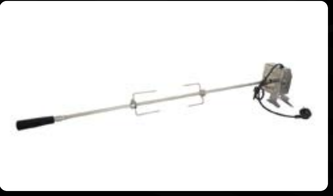
Rotisserie Kit TCS4AC-008 - Rotisserie kit for 4 Burner BBQ - S/S shaft & prongs IPX4 motor.