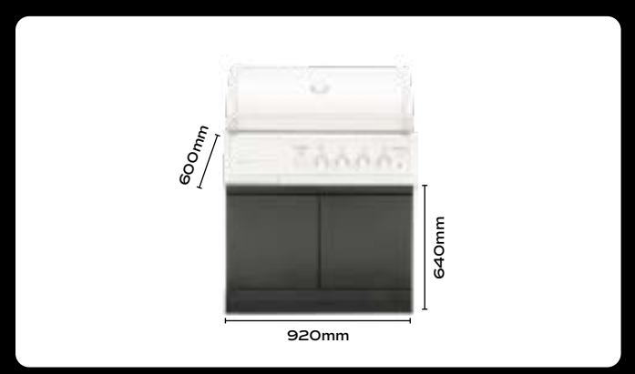
4 Burner Kitchen Cabinet TC4K-BBQCAB - Supports your 4B Series BBQ. With easy access double doors.