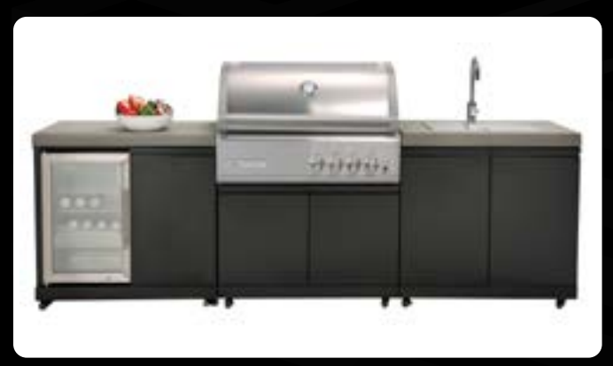
TC4K-04 - Double side cabinets with 1 x flat benchtop & single fridge (L) and 1 x sink (R)