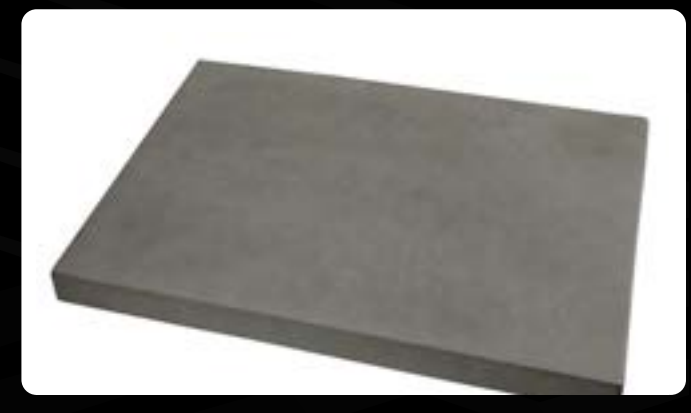
60mm solid composite benchtops (concrete effect)