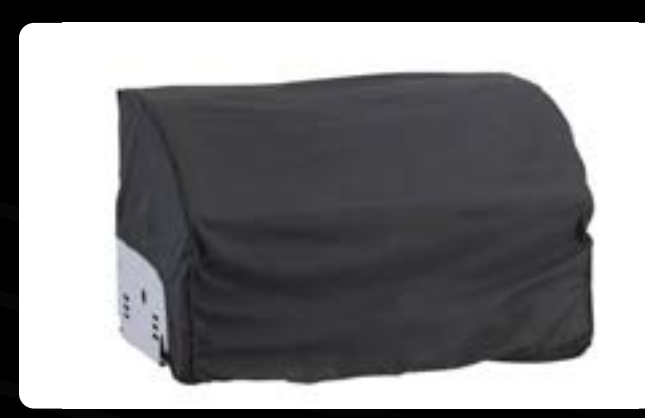
BBQ Cover TCS2AC-006 - Cover for 2 Burner BBQ Woven polyester.