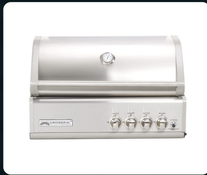
4 burner in-built BBQ Model TCS4FL