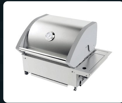
2 burner drop in BBQ Model TCS2IBL