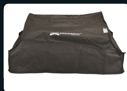
BBQ Cover TCE-COVER