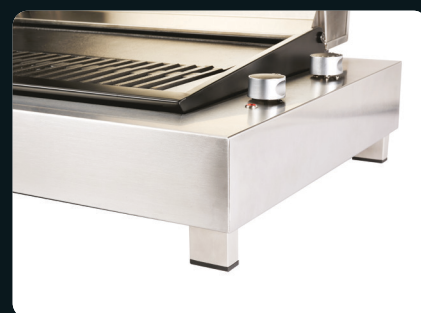
BBQ Feet TCEAC-001