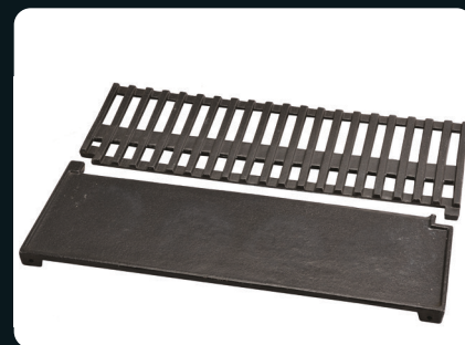
Grill & Hotplate TCE-GRILL & TCE-HOTPLATE

Robust double skin doors and fold-down top shelf provides the perfect platform for the high hood CROSSRAY Electric BBQ flush-mounted in the sintered stone bench-top.