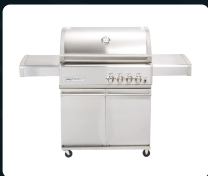
4 burner trolley BBQ Model TCS4PL