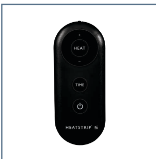
Remote for easy power on/off & heat control.